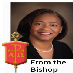
From the Bishop