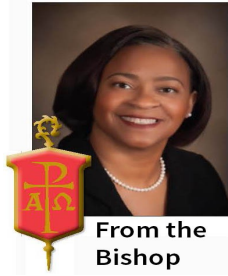
From the Bishop