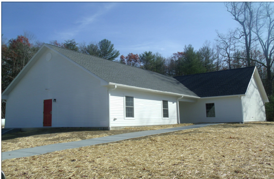
The rebuilt Mt. Bethel United Methodist Church at 148 Rock Mountain Lane, Crimora, VA

Mt. Bethel UMC is very grateful for all the donations, prayers and help that they received throughout this experience. The church has not slowed down, they are busy planning the next fund raiser to finish the new building by adding kitchen cabinets.