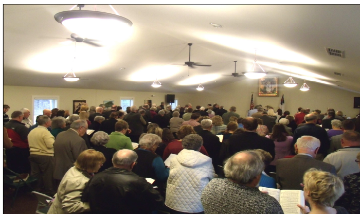
Congregation Members and guests at the Dedication Service held on Sunday, January 6, 2013.